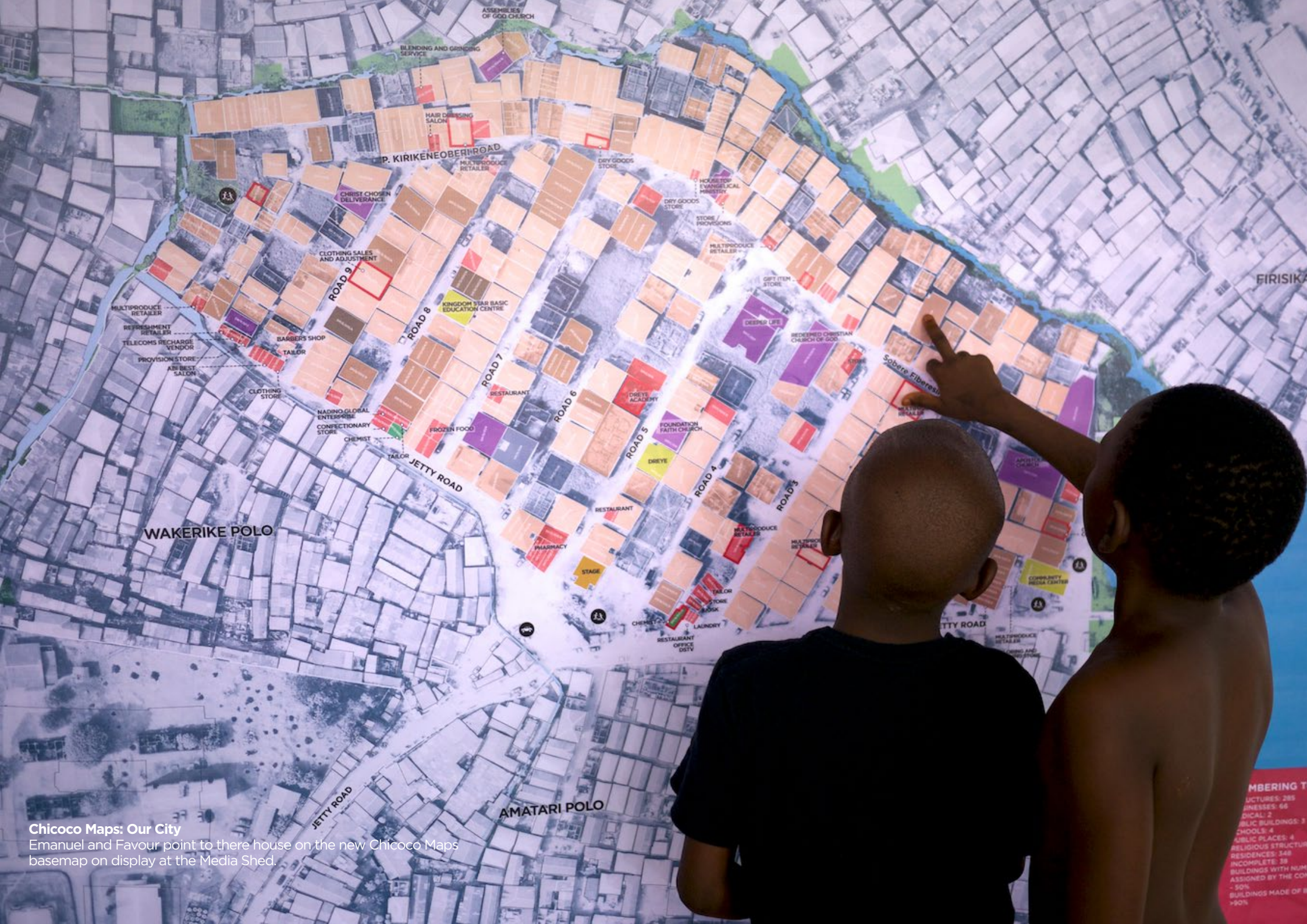
Chicoco Maps: Our City Emanuel and Favour point to their house on the new Chicoco Maps basemap on display at the Media Shed.

NUMBERING T STRUCTURES: 285 BUSINESSSES: 66 MEDICAL: 2 PUBLIC BUILDINGS: 3 SCHOOLS: 4 PUBLIC PLACES: 4 RELIGIOUS STRUCTURE RESIDENCES: 348 INCOMPLETE: 28 BUILDINGS WITH NUM ASSIGNED BY THE COM ~ 50% BUILDINGS MADE OF R ~50%